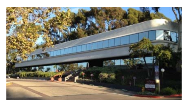
Neuro-IFRAH® Center La Jolla, CA